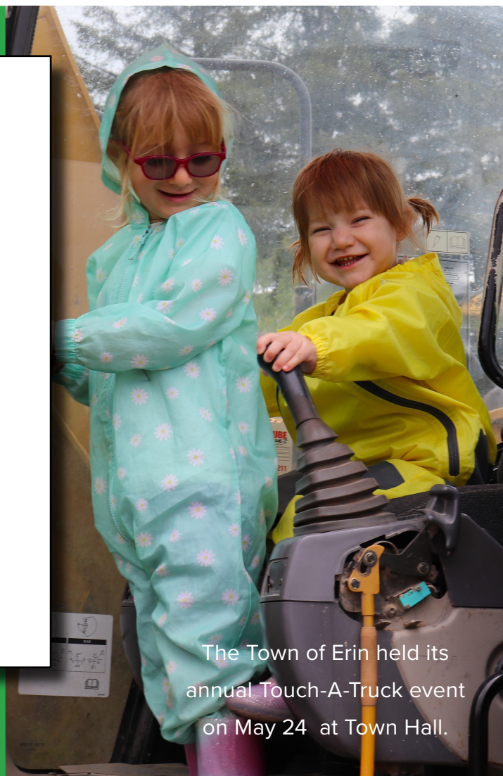
The Town of Erin held its annual Touch-A-Truck event on May 24 at Town Hall.

Town of Erin Email Newsletter June 4, 2025