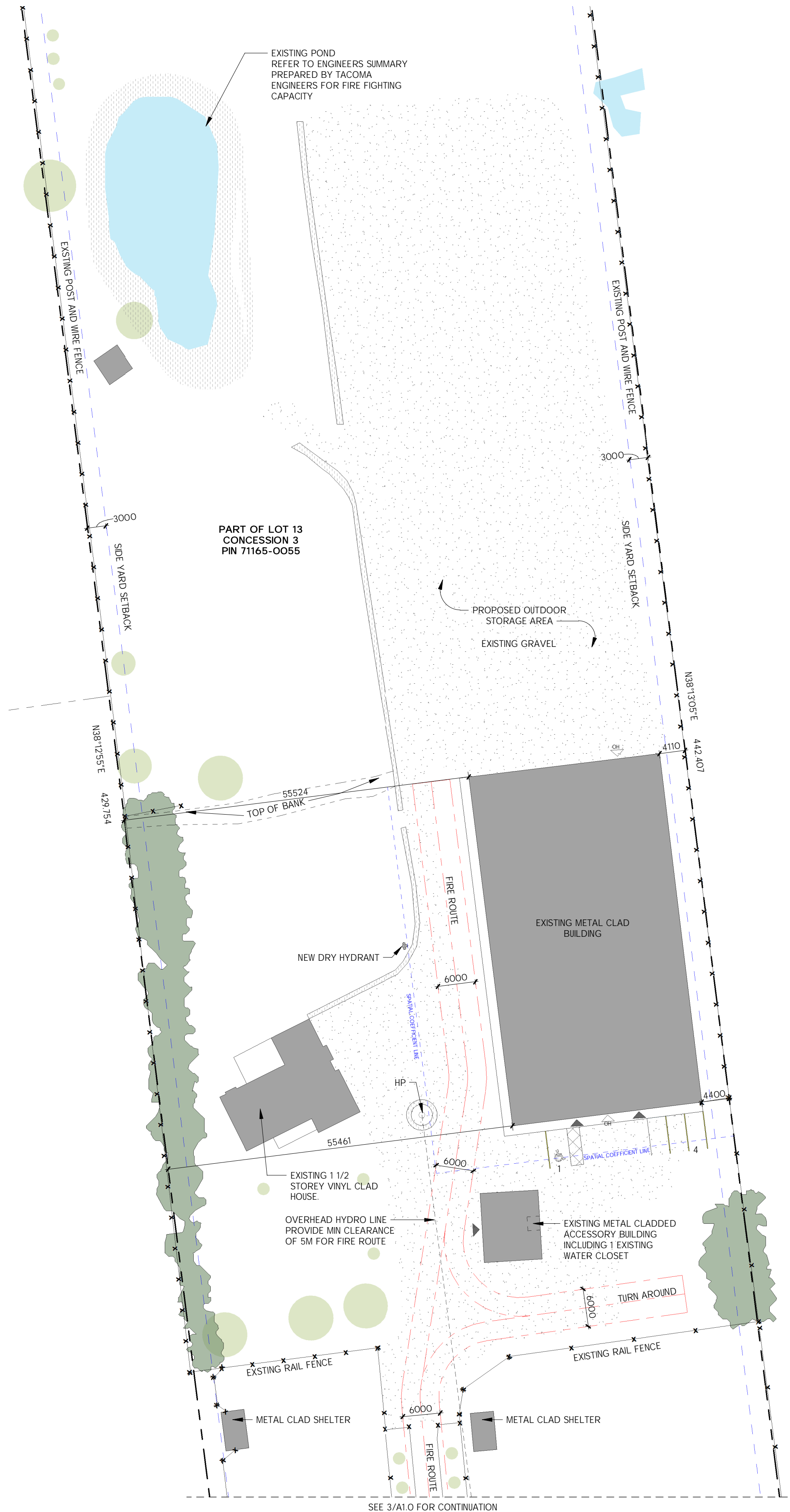
2 Enlarged Site Plan A1.0 1 : 500