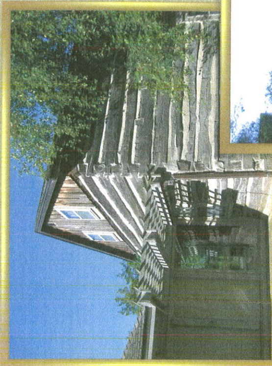
#5151 - 6th line