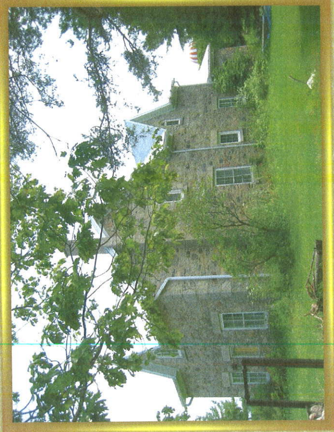
5210 - 5th line