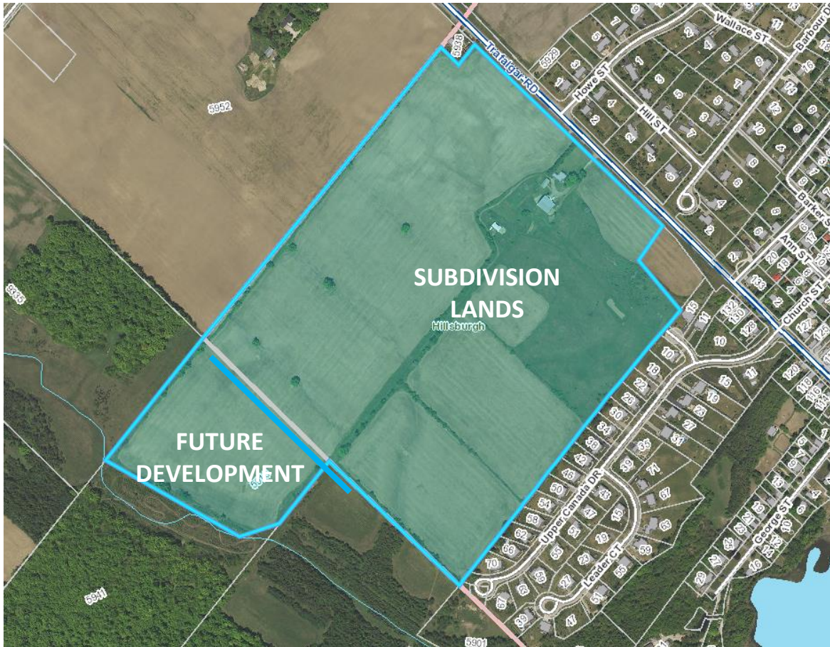
Figure 1: Aerial Photo