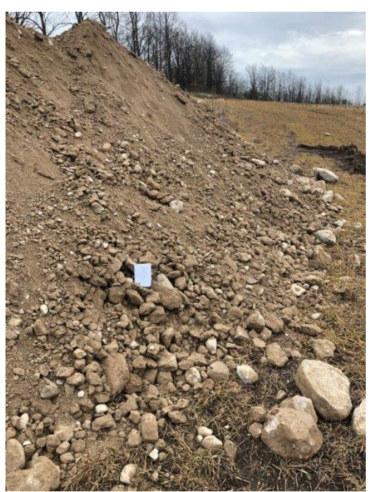
Photograph 5- Excavated soils from TP5. Note large boulders in soil pile.