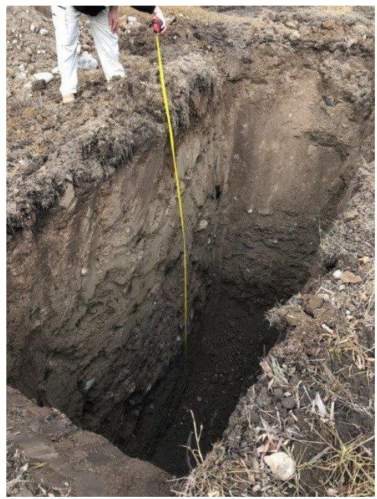
Photograph 1- View of excavation for TP1.