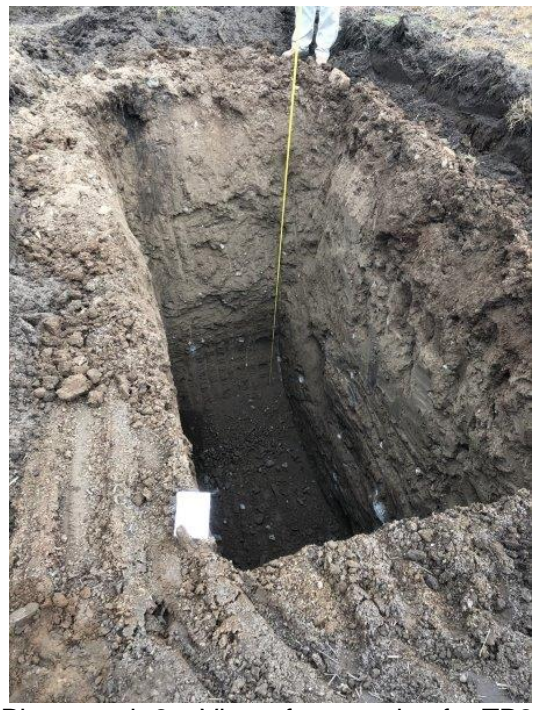
Photograph 2 – View of excavation for TP2.