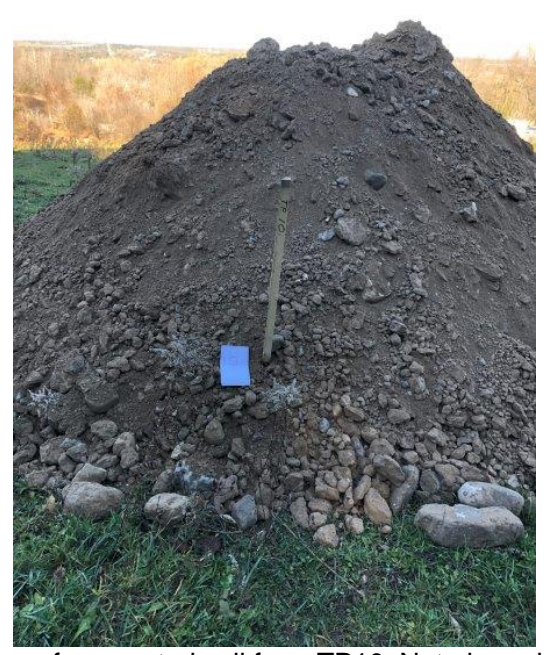
Photograph 10- View of excavated soil from TP10. Note large boulders in soil pile.