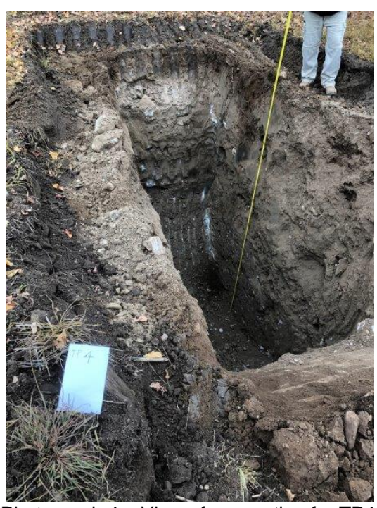
Photograph 4 – View of excavation for TP4.