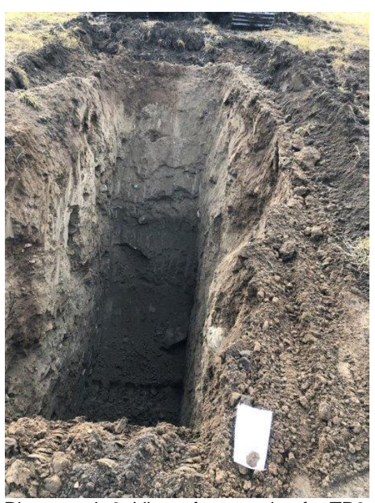
Photograph 6- View of excavation for TP6.