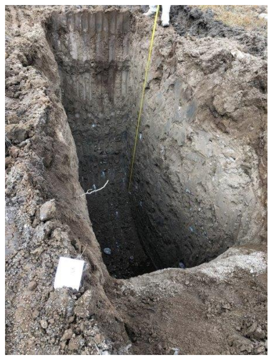
Photograph 3- View of excavation for TP3.