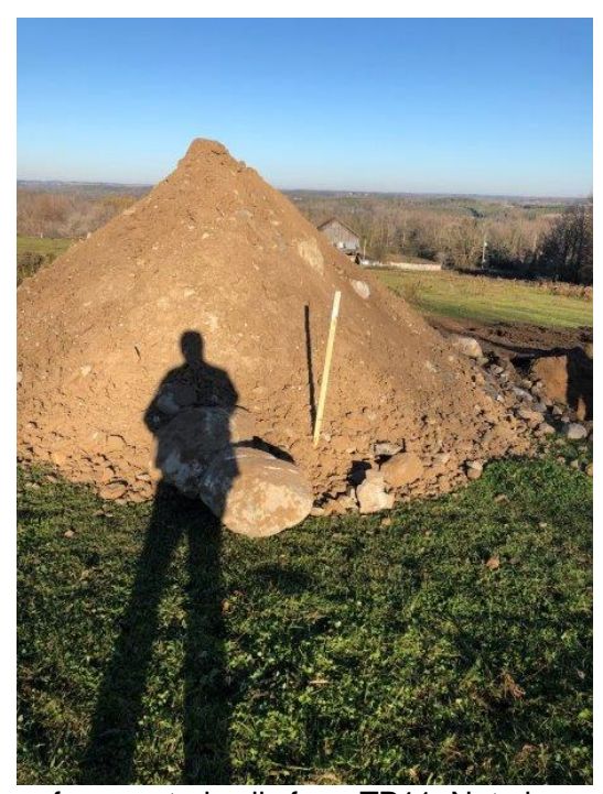
Photograph 12- View of excavated soils from TP11. Note large boulders in soil pile.