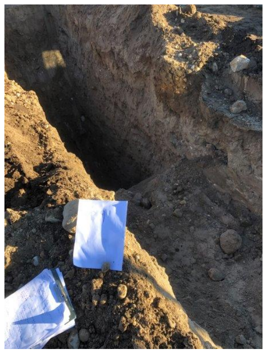
Photograph 9- View of excavation for TP9.