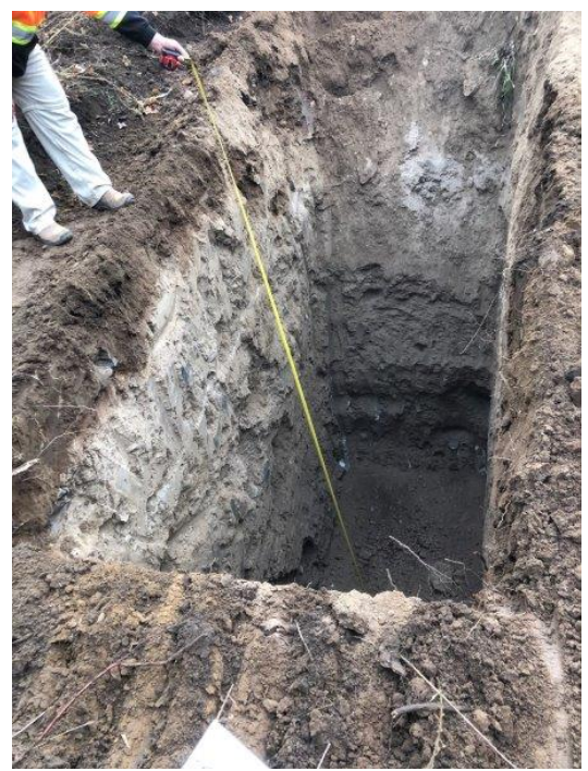
Photograph 7- View of excavation for TP7.