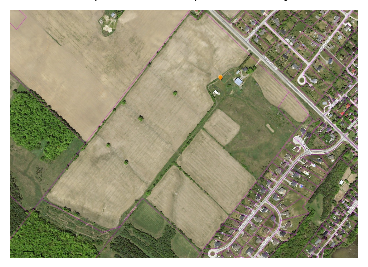
Figure 1. Subject Lot at 5916 Trafalgar Road North. Erin, ON. Part 1 and Part 2 Lot 26 Concession 7

The Urban Arborist Inc was retained by Hillsburgh Heights Inc. to prepare a Tree Inventory, Protection Plan, and Removal Plan for a proposed subdivision. One section of land is to be left for future uses. Area of land to be developed is shown in Tree Inventory / Protection Plan Drawing TP-1.