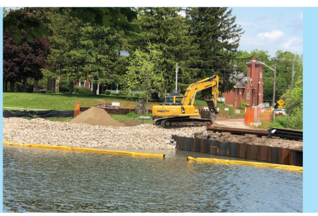
Station Street Bridge and Dam Reconstruction