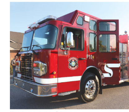
Fire Pumper Truck 11

Your voice matters to us and we want to hear what matters most to you. This year we are re-issuing the budget survey, which will be available from July 27 , 2020 until September 8 , 2020 . Digital copies will be available on www.erin.ca and physical copies will be mailed out, upon request.