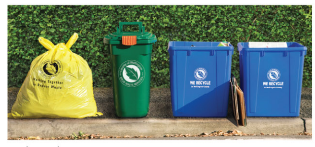
Dual Recycling Bins

For waste disposal sites, recycling and collection inquiries please phone the County of Wellington, 519.837.2601 or toll free, 1.866.296.0248 .