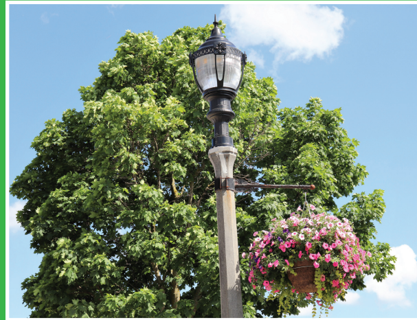
LED Streetlight Conversion

The Town of Erin did a full streetlight conversion to switch the incandescent lights to LED. That's over 800 streetlights switched to lower the Town's Carbon Footprint and reduce costs to taxpayers!