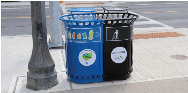
Dual Recycling Bins

For waste disposal sites, recycling and collection inquiries please phone the County of Wellington, 519.837.2601 or toll free, 1.866.296.0248 .