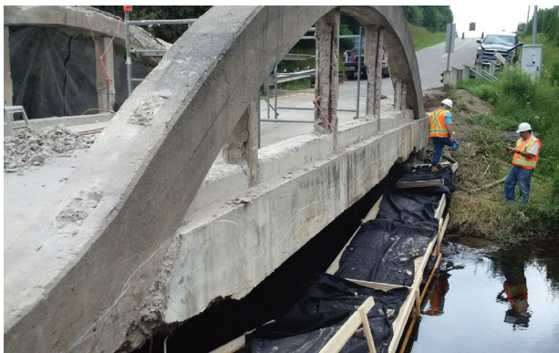
Culvert 2045 – Fourth Line

Full chart and by-law is available at www.erin.ca .