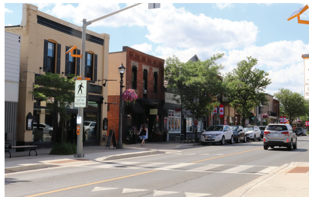
Crosswalk on Main Street