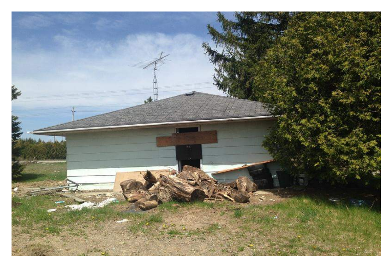
Side 1 Elevation