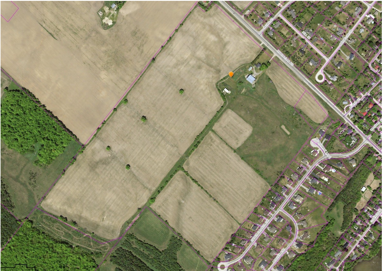
Figure 1. Subject Lot at 5916 Trafalgar Road North. Erin, ON. Part 1 and Part 2 Lot 26 Concession 7

The Urban Arborist Inc was retained by Hillsburgh Heights Inc. to prepare a Tree Inventory, Protection Plan, and Removal Plan for a proposed subdivision. One section of land is to be left for future uses. Area of land to be developed is shown in Tree Inventory / Protection Plan Drawing TP-1.