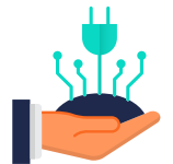
Infrastructure Renewal and Replacement