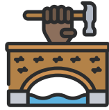
Roads and Bridges

Keep the Town's assets such as roads, bridges, buildings in a state of good repair