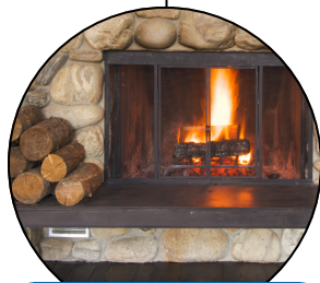
FIREPLACES AND FIREPLACE INSERTS

What heating equipment in my home can cause fires?