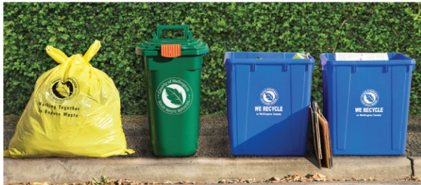
Dual Recycling Bins

For waste disposal sites, recycling and collection inquiries please phone the County of Wellington, 519.837.2601 or toll free, 1.866.296.0248 .