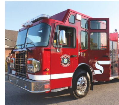
Fire Pumper Truck 11

Your voice matters to us and we want to hear what matters most to you. This year we are re-issuing the budget survey, which will be available from July 27, 2020 until September 8, 2020 . Digital copies will be available on www.erin.ca and physical copies will be mailed out, upon request.