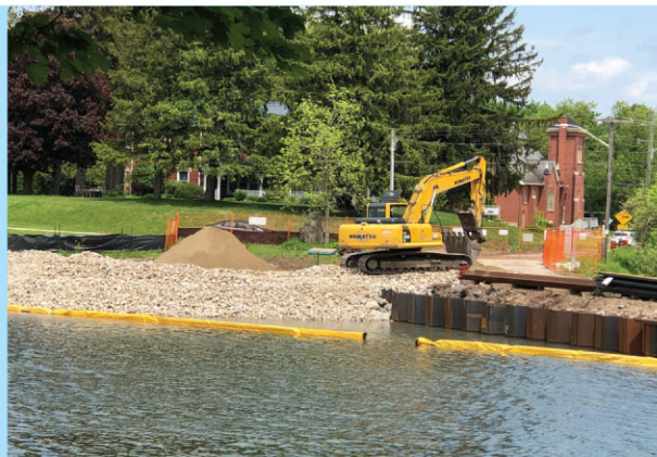
Station Street Bridge and Dam Reconstruction